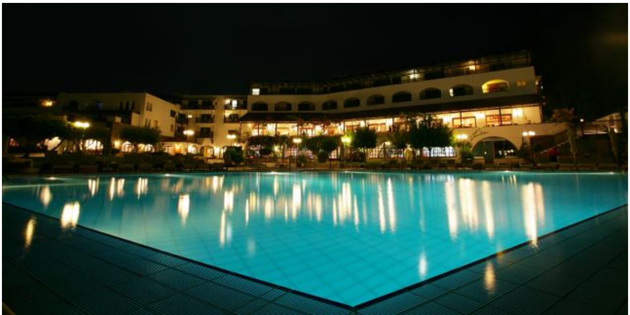
In the photograph: The Creta Maris Beach Resort pool area and balcony bar

The first congress day was topped off with a generous welcome reception at the five-star Creta Maris Beach Resort.