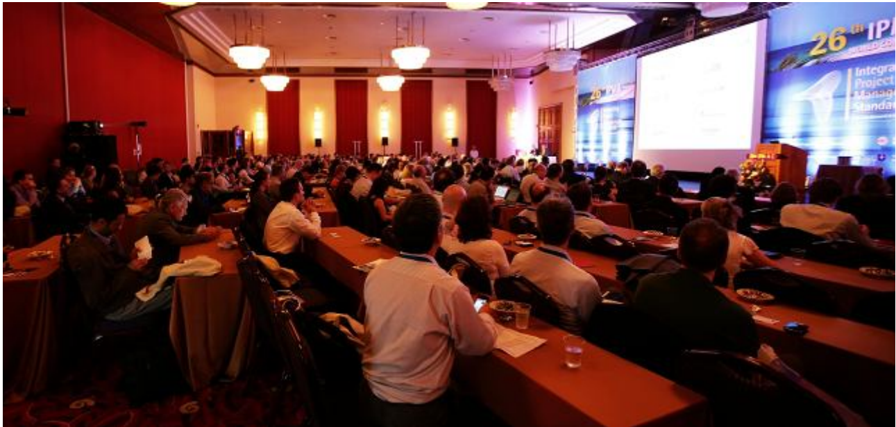
In the photograph: Opening ceremony of the 26 th IPMA World Congress

The congress was organized by the Network of Project Managers in Greece (PM-Greece) , the Greek IPMA Member Association, in cooperation with the National Technical University of Athens (NTUA) , under auspices of the Hellenic Ministry of Infrastructure .