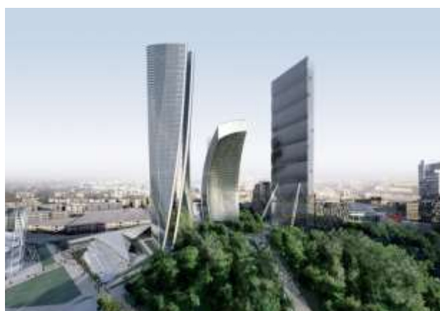
A rendering how the new district will appear

In this area of 25 thousand square meters were planted 317 tall trees of 39 different species: beech trees of different sizes, maple trees, cherry trees, plane trees (out of about 7,000 square meters), lawn areas and shrubs (out of about 9,800 square meters), paved areas in the central part in which is embedded a large ellipsoidal fountain. The CityLife project in the public park is the result of an international competition won in 2010 by the British Gustafson-Porte together with Italian One Works and the landscape concept reflects the microcosm of Milan and its region of Lombardy.