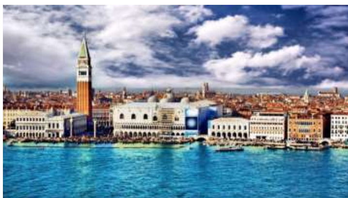
A panoramic view of Venice

Mose is the system of mobile barriers to protect Venice from high waters. The shipyards for the construction of dams, formed by large steel gates, are now at an advanced stage. Between June and July of 2013 were installed the first four gates in the bottom of the