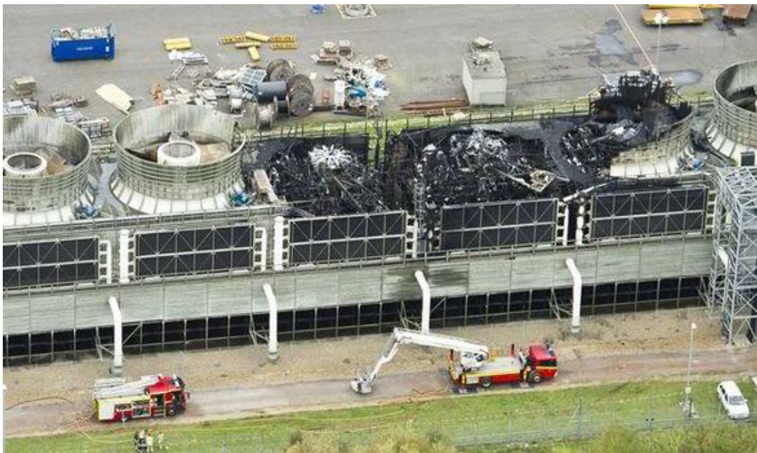
Aerial view of the damaged Didcot Power Station

A major fire at Didcot B power station has called into question whether or not plans to keep the lights on over the winter can succeed. Capacity is at its lowest for 7 years and the first test of new plans is expected to come in early December when some plants will be shut down for maintenance just as demand increases.