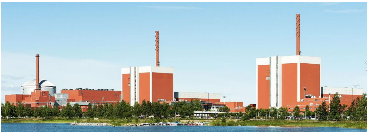
In the photograph: Olkiluoto 3 nuclear power plant – on the left – is nearing completion despite the Areva and TVO compensation dispute.

The matter is made more challenging by the French government plan to sell its majority share of Areva stock to Électricité de France (EDF) S.A. – the French electric utility company, largely owned by the French state, headquartered in Paris, France, with 65 200 M€ in revenues in 2010. EDF operates a diverse portfolio of over 120 GW of electrical power generation capacity in Europe, South America, North America, Asia, the Middle East and Africa. The French government would like to merge the loss-making Areva with EDF, however, EDF is unwilling to proceed with the proposed arrangement understanding the international arbitration may agree with TVO's claims.