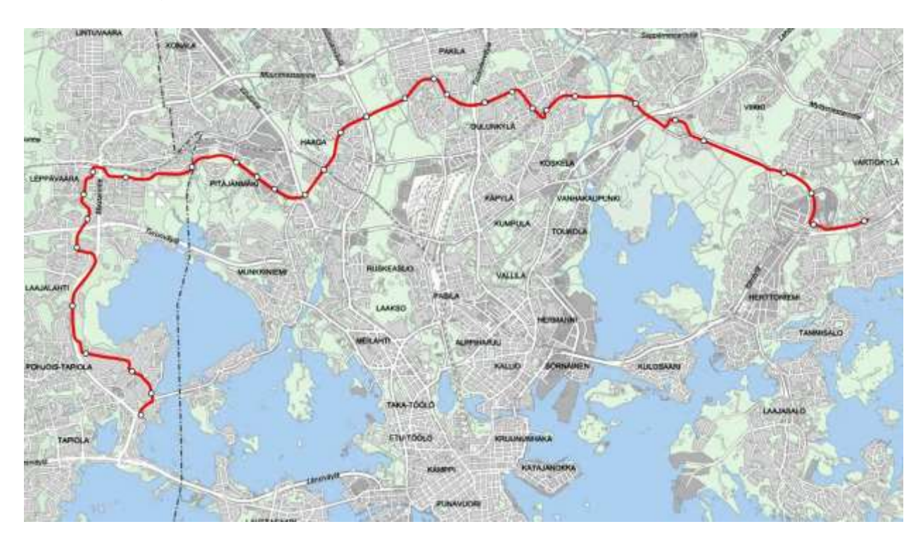
In the illustration: Raide-Jokeri will circumvent downtown Helsinki

A preliminary routing of the track was published in January 2017. Private people owning real estate and residential buildings along the route, especially the ones with property likely requiring expropriation, have criticized the planned route extensively.