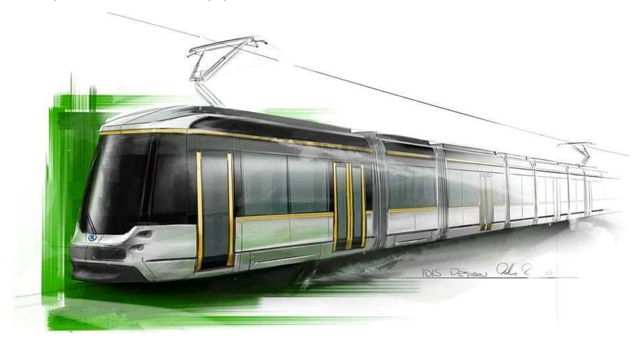
In the illustration: An artist's view of Raide-Jokeri rolling stock (illustration courtesy HKL)

The first trials of the expected Raide-Jokeri rolling stock were performed in March in Helsinki. The Raide-Jokeri cars will be much longer than the existing ones, and the existing rail network will need modifications at certain sections in order to allow trouble-free operation of the new equipment.