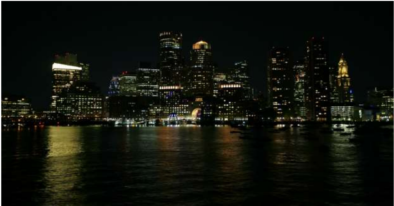
View of downtown Boston from the Conference Dinner Cruise

The first conference day way concluded with a Conference Dinner Cruise on the Boston Harbor, sponsored by PMI.