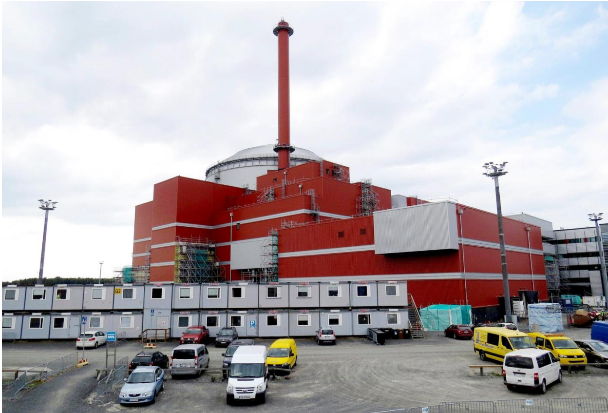
In the photograph: Olkiluoto 3 construction site

electrical power generation capacity in Europe, South America, North America, Asia, the Middle East and Africa. The French government would like to merge the loss-making Areva with EDF, however, EDF has been unwilling to proceed with proposed arrangement understanding the international arbitration may agree with TVO's claims.