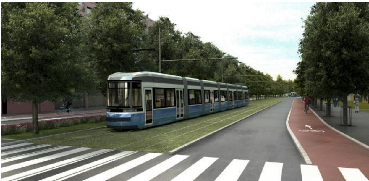
In the illustration: An artist's view of the Raide-jokeri train (illustration courtesy HSL)

The Raide-Jokeri light rail transit system – similar to the Metro Blue Line light rail in Minneapolis, Minnesota, US, and the Metrolink in Manchester, England – is planned for the metropolitan Helsinki area to complement the existing public transit service. Raide-Jokeri will connect two Helsinki metro stations – Itäkeskus in eastern Helsinki, and Keilaniemi in the eastern Espoo – to one another with 25 km of street-level double track and 33 stops. Raide-Jokeri will replace bus line 550, which is currently the most heavily congested line in metropolitan Helsinki area, in 2021. The new light rail transit system is intended to enhance the reliability and travel comfort of the transverse public transportation i.e. traffic in the areas surrounding the immediate downtown Helsinki.