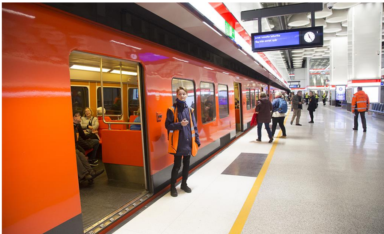
In the photograph: Länsimetro finally commenced operations

The start of the commercial operation took on a carnival spirit, as many of the stations had crowds of celebrating people waiting to board the first train from Matinkylä at 5.09 am. Since the first day, operations have stabilized, and bus connections taking people to and from the new metro stations are expected to start at New Year.