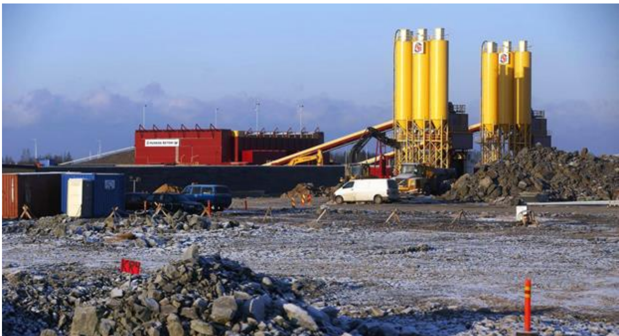
In the photograph: The Hanhikivi construction site