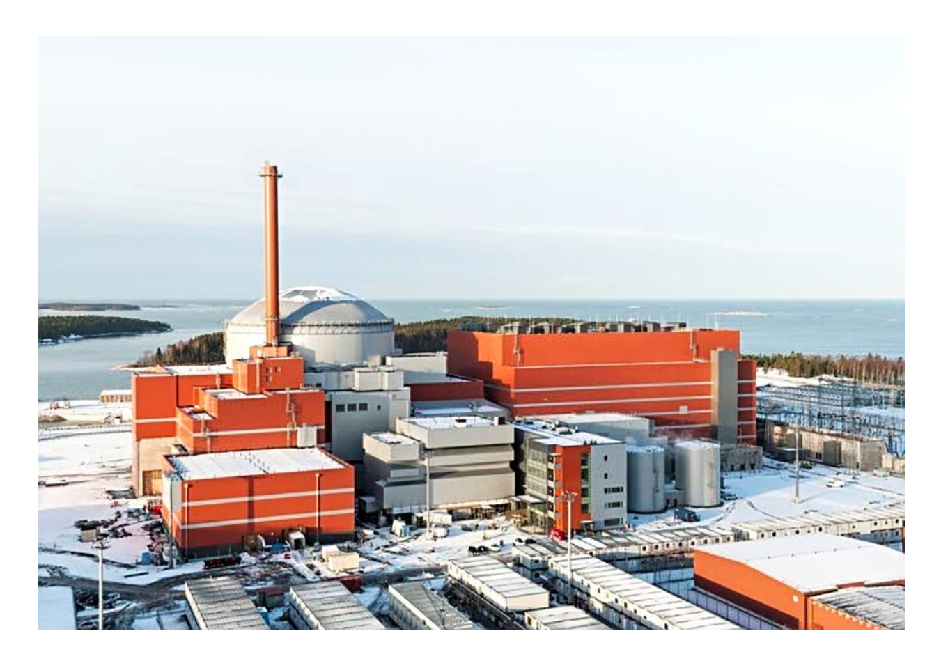
In the photograph: Olkiluoto 3 construction site