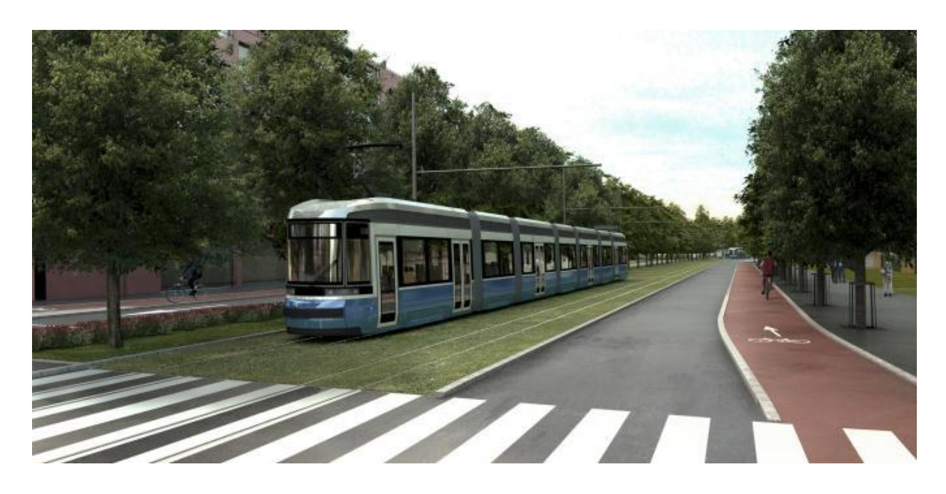
In the illustration: An artist's view of the Raide-jokeri train (illustration courtesy HSL)

The Raide-Jokeri light rail transit system – similar to the Metro Blue Line light rail in Minneapolis, Minnesota, US, and the Metrolink in Manchester, England – is planned for the metropolitan Helsinki area to complement the existing public transit service. Raide-Jokeri will connect two Helsinki metro stations – Itäkeskus in eastern Helsinki, and Keilaniemi in the eastern Espoo – to one another with 25 km of street-level double track and 33 stops. Raide-Jokeri will replace bus line 550, which is currently the most heavily congested line in metropolitan Helsinki area, in 2021. The new light rail transit system is intended to enhance the reliability and travel comfort of the transverse public transportation i.e. traffic in the areas surrounding the immediate downtown Helsinki.