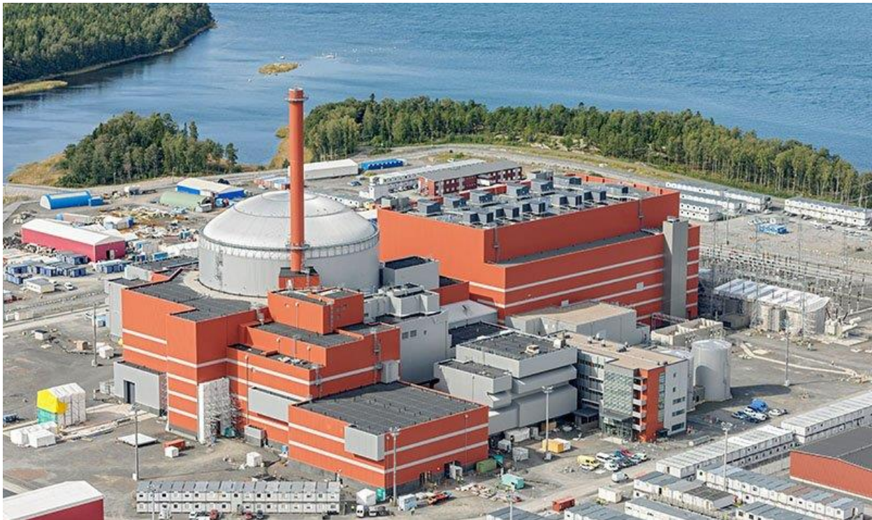
Olkiluoto 3 power station nearing completion