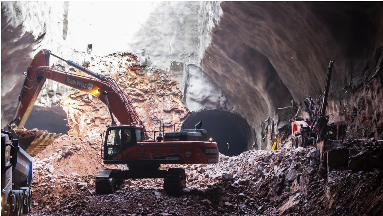
Länsimetro tunneling works progressing

The second implementation phase of Länsimetro extension to the existing Helsinki metro system is progressing. The main underground tunneling work has been completed, and some of the auxiliary spaces are currently being finalized. With an additional 400 M€ budget for the second phase of the westward extension, the overall budget is now 1 159 M€. The time schedule was extended similarly so that the entire extension will be operational in 2023. Some stakeholders are seeing this as a recurrence of the trouble and challenges in the first implementation phase of the Länsimetro project.