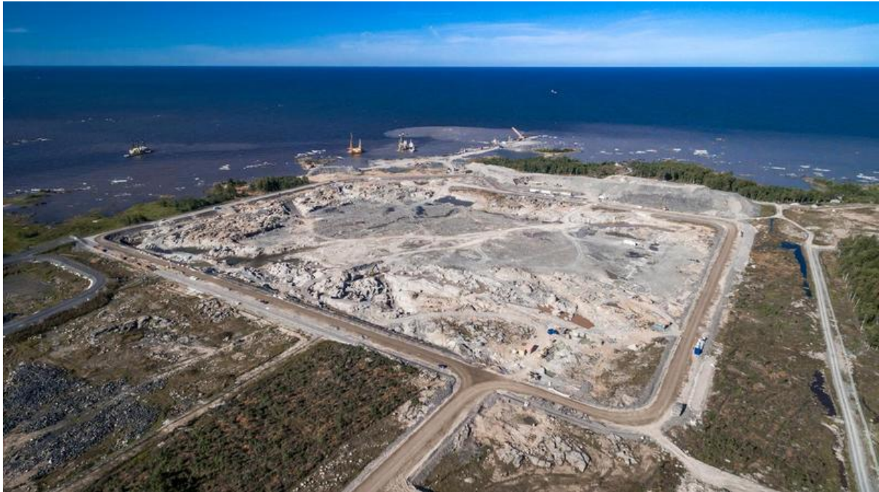
The Fennovoima construction site at Hanhikivi

A preliminary approval to construct the plant was granted by the Finnish Government in April 2010, and by the Finnish Parliament in July 2010. The decision to invest in the power plant was made by Voimayhtiö SF, the largest owner of Fennovoima, in February 2014. The final permit to construct the plant – applied for by Fennovoima in June 2015 – is now expected to be granted by the Finnish Government no earlier than 2019.