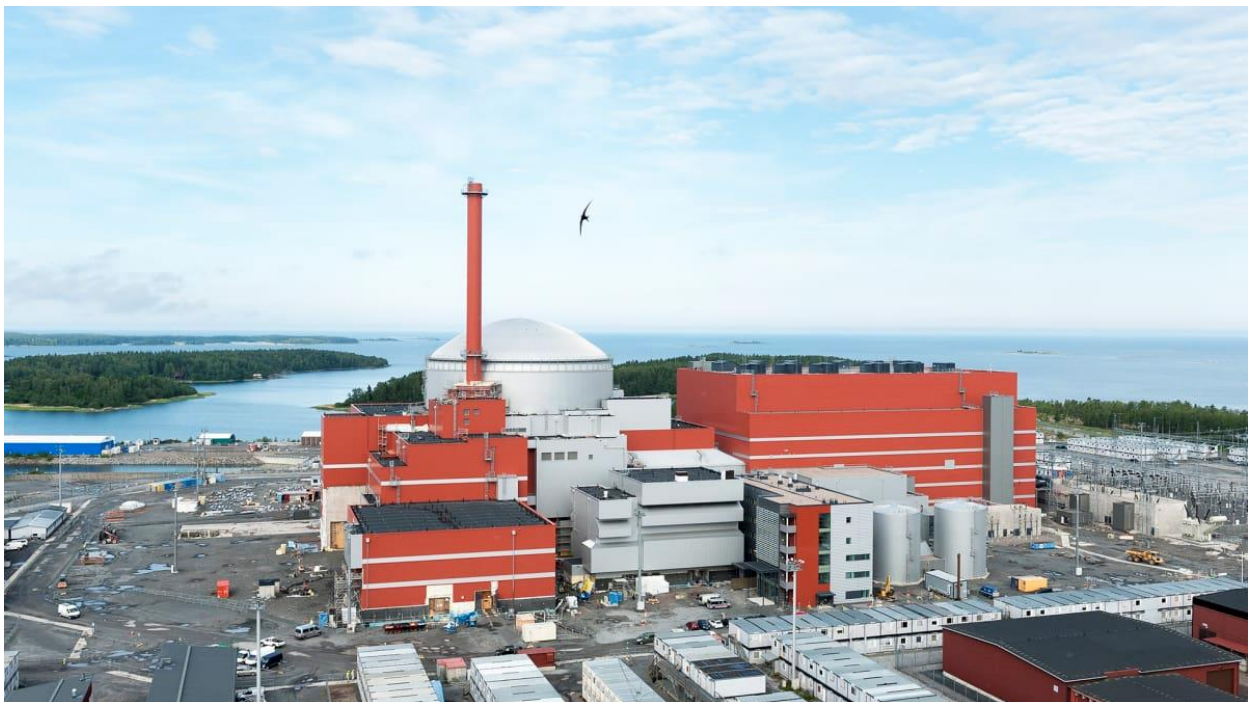
Olkiluoto 3 almost complete

While the Olkiluoto 3 plant is nearing commercial operation, the Finnish Council of State has approved the extension of Olkiluoto 1 and Olkiluoto 2 power plant operation until 2038. Olkiluoto 1 and 2 are each rated at 900 MW electrical power, and annually produce a combined 15 TWh of electrical power to the Finnish power grid. This is approximately 23 % of electrical power annually produced, and approximately 18 % of electrical power annually consumed in Finland.