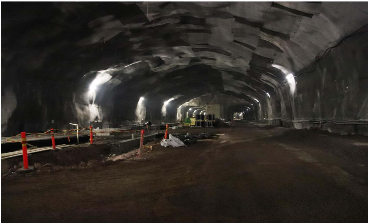
Tunneling works being completed at Kivenlahti station

The second implementation phase of Länsimetro extension to the existing Helsinki metro system is progressing. The main underground tunneling work has been completed, and the finalization of station and auxiliary spaces is under way.