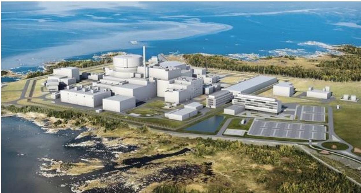
Artist's view of the Hanhikivi 1 plant

Due to the EU sanctions towards Russia, the Hanhikivi 1 plant has become involved in international politics. Many see the Rosatom three-way involvement in the Hanhikivi 1 project – being one of the main shareholders as well as the main contractor and the main equipment supplier – as a way for Russia to get involved in EU matters. Some go as far as seeing the Rosatom involvement in the Hanhikivi 1 project as a way for Russia to strike a blow against a uniform EU sanction policy towards Russia. Setting aside the international politics, experts say the Hanhikivi 1 plant is unlikely to be able to produce electrical power at a price lower than the Teollisuuden Voima Olkiluoto 3 plant.