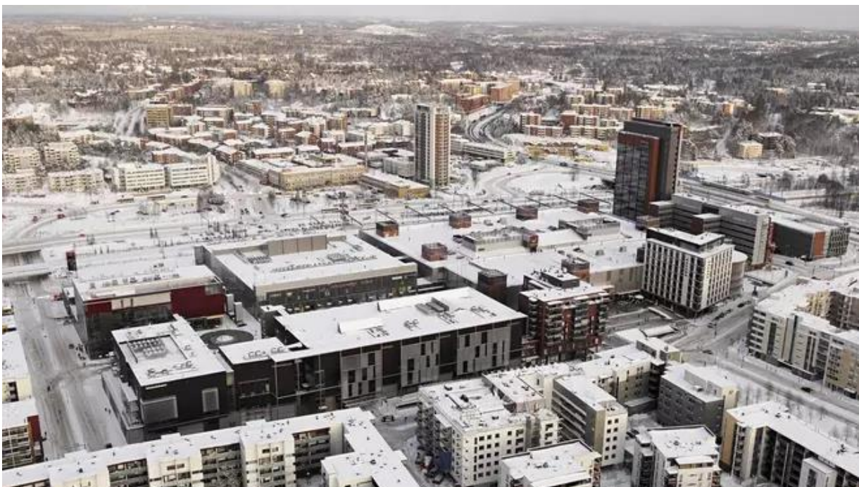
Sello shopping center in Espoo will be subject to traffic arrangements due to the Raide-Jokeri building works

The first idea of a transverse light rail transit system was introduced in 1990, and agreed to be one of the next-generation public transit systems to be constructed in 1994. Instead of a light rail system, the transverse connection was established with bus service in 2006. The number of passengers grew enormously, and bus connection 550 along the proposed path of the Raide-Jokeri route is one of the most popular bus service offered by Helsinki Regional Transport Authority. Due to increasing traffic, and need for quick and reliable connection, the plan to establish the originally proposed light rail transit system has been approved by the city of and the city of Espoo.