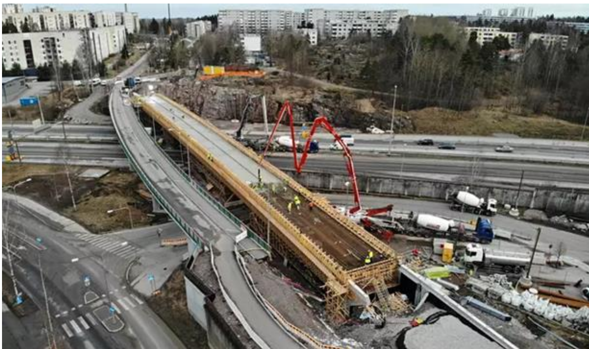
Raide-Jokeri bridge concrete pouring at Viikki

The first idea of a transverse light rail transit system was introduced in 1990, and agreed to be one of the next-generation public transit systems to be constructed in 1994. Instead of a light rail system, the transverse connection was established with bus service in 2006. The number of passengers grew enormously, and bus connection 550 along the proposed path of the Raide-Jokeri route is one of the most popular bus service offered by Helsinki Regional Transport Authority. Due to increasing traffic, and need for quick and reliable connection, the plan to establish the originally proposed light rail transit system has been approved by the city of and the city of Espoo.