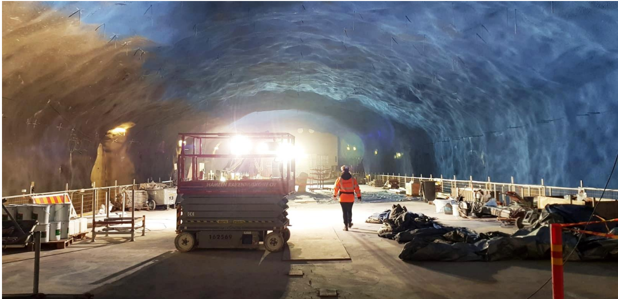
Espoonlahti station hall with ceiling painted blue

The second implementation phase of Länsimetro extension to the existing Helsinki metro system is now at halfway according to budget and time schedule baselines. The main underground tunneling work has been completed, and the finalization of station and auxiliary spaces is under way.