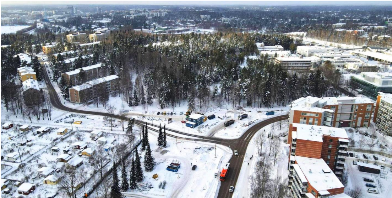
Tunneling works are progressing near Pajamäki

The consortium comprising Yleinen Insinööritoimisto (YIT) and VR Track is proceeding with the main building works for the Raide-Jokeri light rail line. COVID-19 pandemic has not affected main building works' time schedules, and tunneling works are progressing after the complaints by local civic organizations have been ruled upon.