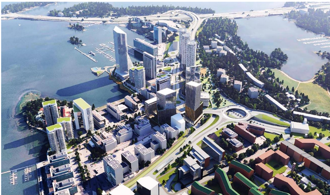
High-rise buildings to be erected at Keilaniemi station

The second implementation phase of Länsimetro extension to the existing Helsinki metro system is currently proceeding within set budget and time schedule baselines: The laying of tracks has been completed, and the most intense construction phases have been completed. The city of Espoo is now planning a series of high-rise buildings – both office and residential – to be erected next to the Keilaniemi station, which was part of the original Länsimetro extension. COVID-19 pandemic has not affected times schedules, however, some construction sites have seen multiple cases of the virus, believed to be transmitted among the international work crews.