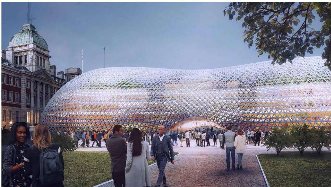
Pop-up Parliament by Lord Foster.

Not to be outdone by these major projects the Parliament Refurbishment Project limps on. The latest wheeze is a transparent pop-up Parliament venue. Proposed by Lord Foster , the architect behind projects such as the Millau Viaduct and London's Gherkin, the idea is the brainchild of the property magnate Sir John Ritblat ,