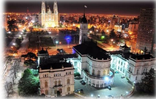
La Plata city – Government building with the Cathedral in the back