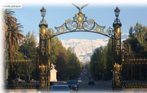
San Martin Park, Mendoza City