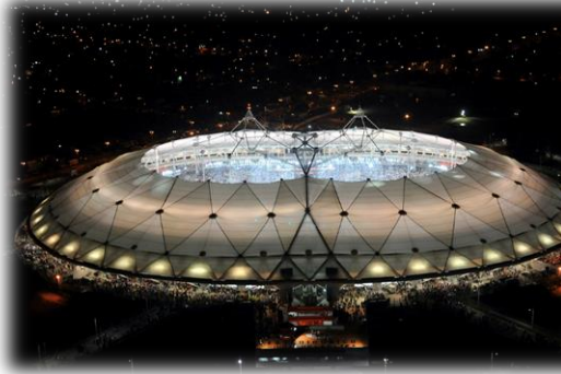
La Plata city – Estadio Único de La Plata - Sports stadium