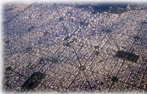
La Plata city, interesting urban layout with diagonal streets to reduce transportation times