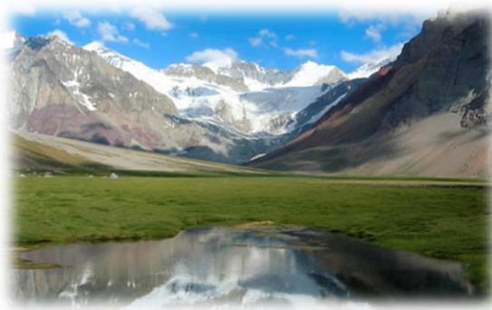
Mount Aconcagua in the back. In front, Laguna de los Horcones, at its feet

As promised earlier in this report, I attach photographs of the cities with PMI Argentina Chapters