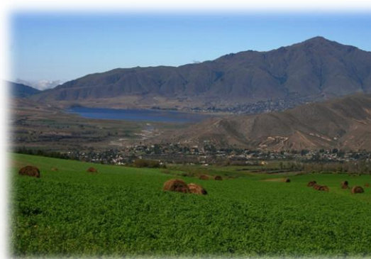
Tafi del Valle – Province of Tucumán