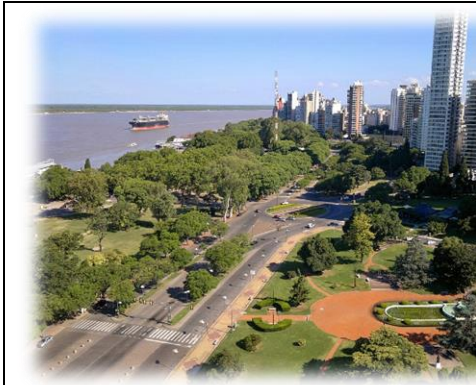
Rosario city – Province of Santa Fe