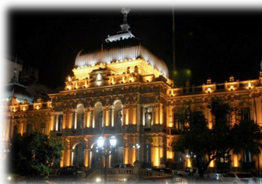
Tucumán city – Government building