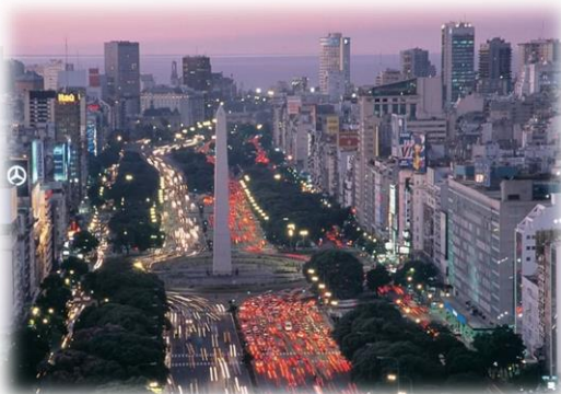
Buenos Aires city