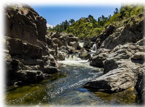
Province of Córdoba, its mountains, rivers and lakes