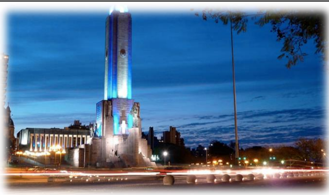
Monument to our National Flag – Rosario city