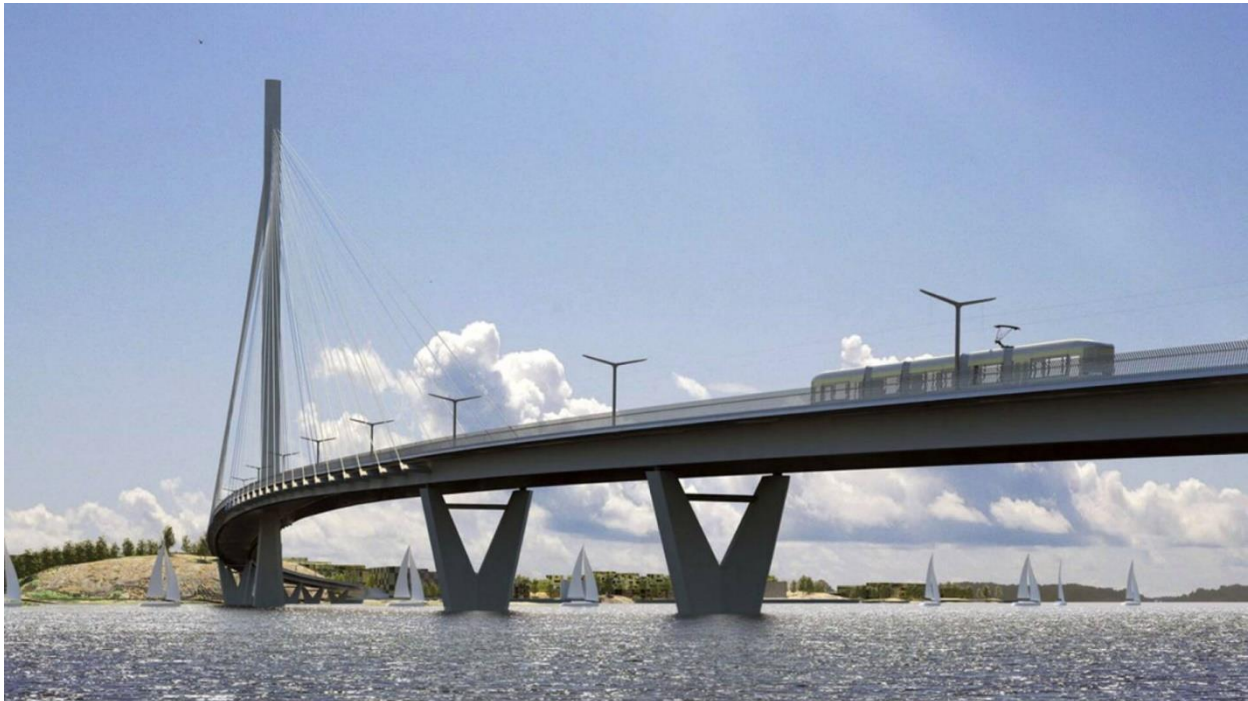
Artist's view of Kruunuvuorensilta

Kruunusillat [ Crown Bridges ] is a major new infrastructure project in downtown Helsinki. The project is set to construct a string of bridges in order to traverse Kruunuvuorenselkä , a waterway east of the downtown area, and to establish a new tram line to connect the Laajasalo , Korkeasaari and Kalasadama areas to the immediate downtown area by means of 10 km light rail line. A new scenic seaside walking and bicycling path will also be created. The project will be implemented following the alliance way of working, with the City of Helsinki , YIT , NRC Group Finland , Ramboll Finland , Sweco Infra & Rail and Sitowise participating as members of the alliance.