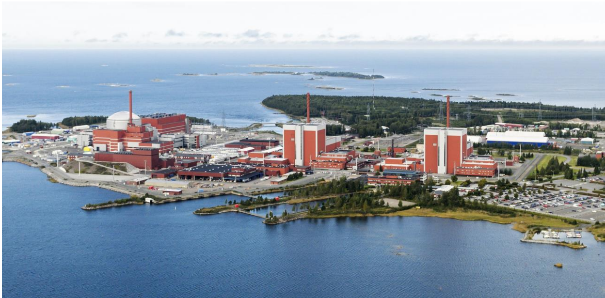
Olkiluoto power stations with the number 3 unit at the left