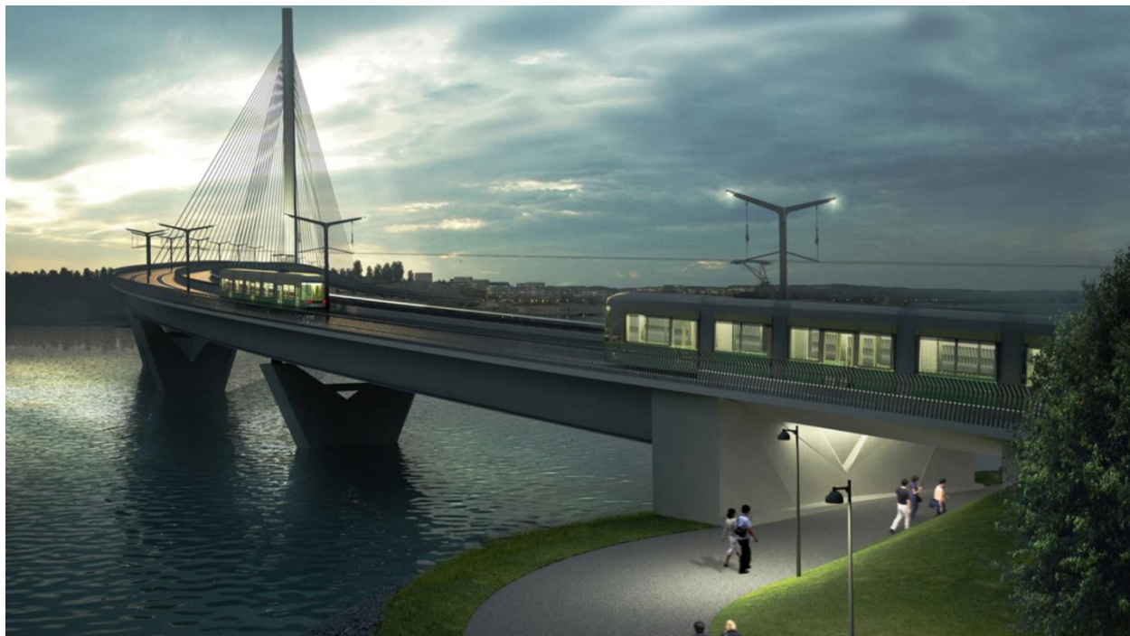
Artist's view of two trams crossing the Kruunusillat bridge (illustration courtesy rakennuslehti.fi)

Kruunusillat [ Crown Bridges ] is a major new infrastructure project in downtown Helsinki. The project is set to construct a string of bridges in order to traverse Kruunuvuorenselkä , a waterway east of the downtown area, and to establish a new tram line to connect the Laajasalo , Korkeasaari and Kalasadama areas to the immediate downtown area by means of 10 km light rail line. A new scenic seaside walking and bicycling path will also be created. The project will be implemented following the alliance way of working, with the City of Helsinki , YIT , NRC Group Finland , Ramboll Finland , Sweco Infra & Rail and Sitowise participating as members of the alliance.