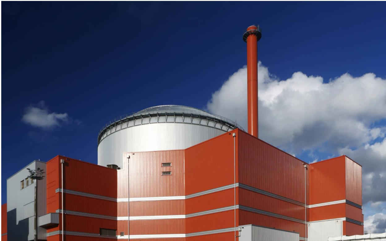
Olkiluoto 3 power station is now completed