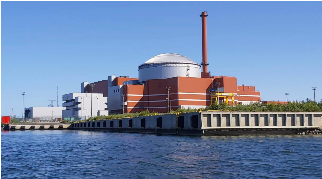
Olkiluoto 3 power station is now completed