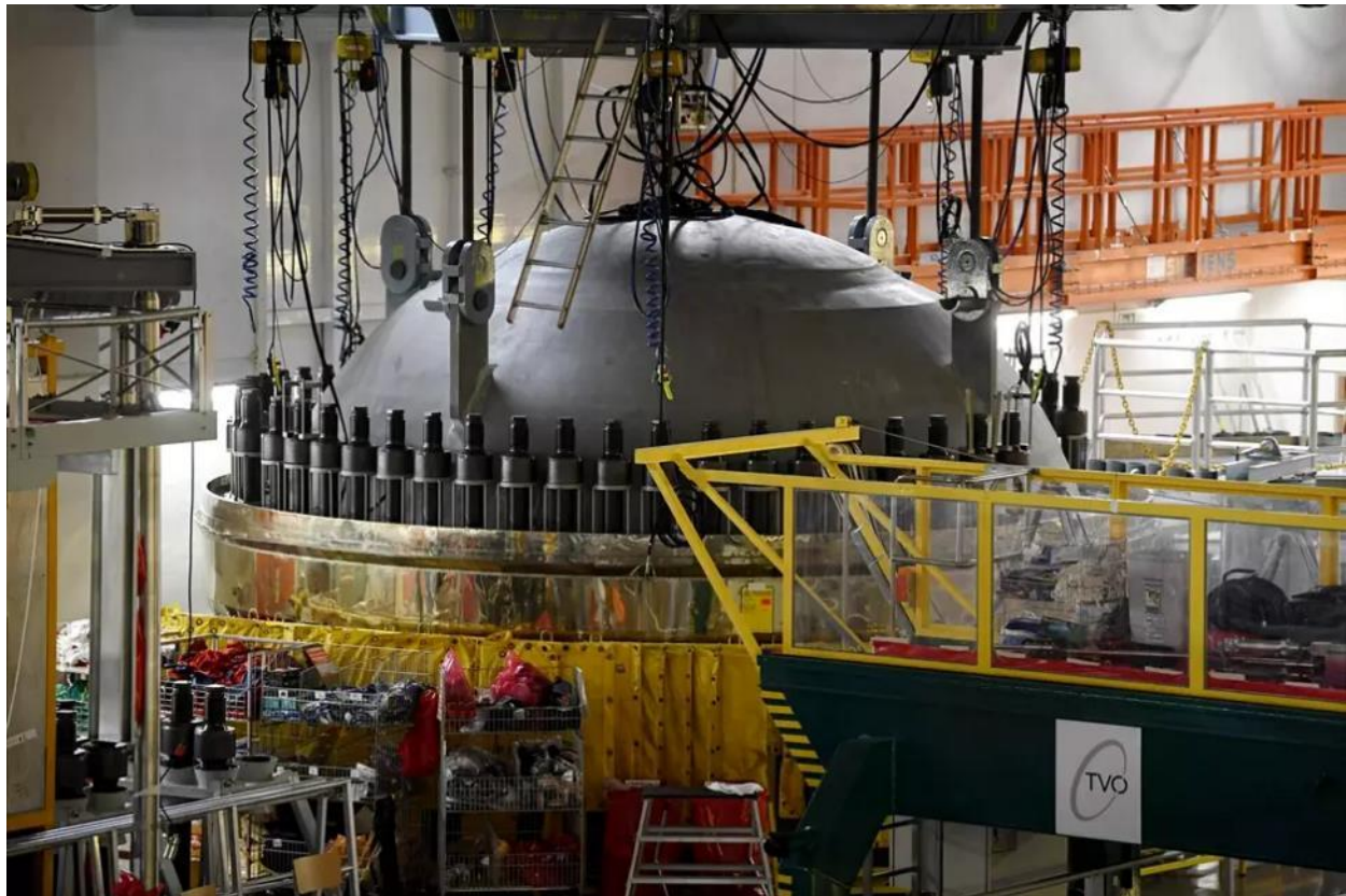
Olkiluoto 3 power station is now completed