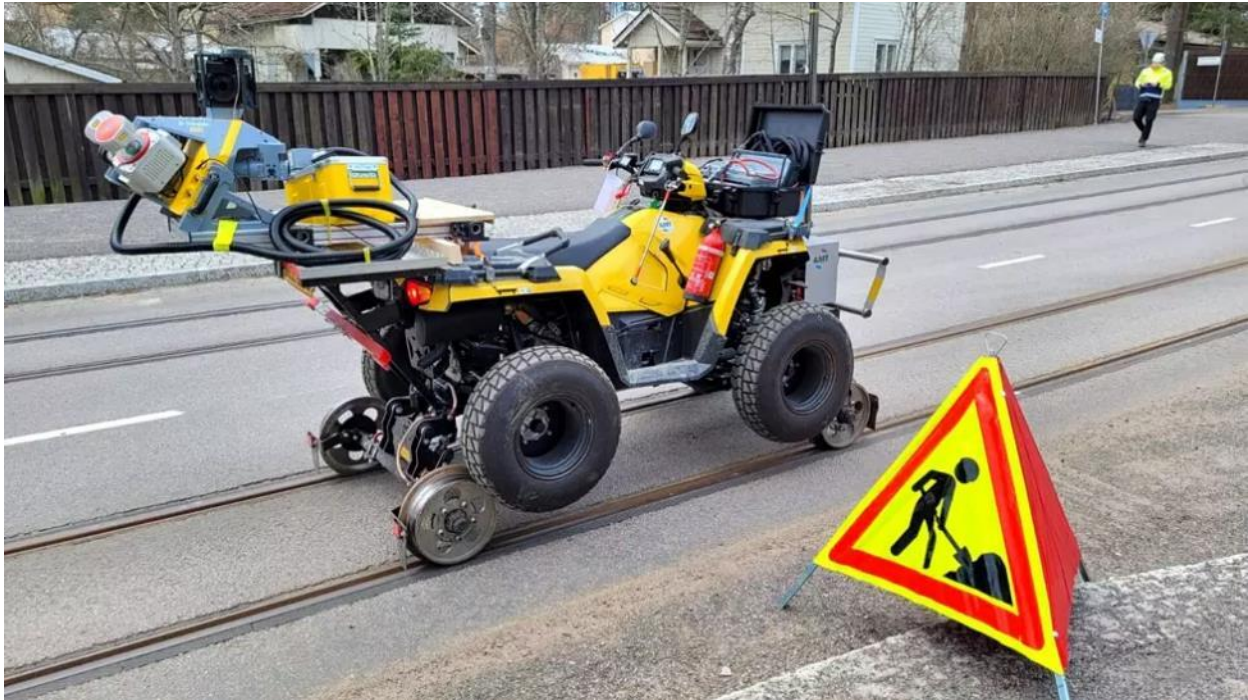
Raide-Jokeri tracks testing with a modified all-terrain vehicle

The consortium comprising YIT and VR Track is finalizing the construction of the Raide-Jokeri light rail line. The project is currently well ahead of the original time schedule, and construction works are almost completed. The new tracks are currently being tested with an all-terrain vehicle modified for running on tracks. Due to the smooth construction phase, it may be possible to start commercial operations in early 2024.