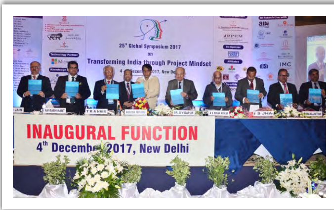
(2017) Hon'ble Minister of Industry and Commerce, Shri Suresh Prabhu released the book titled 'Building a Project Oriented Society' covering project management events from 1992 to 2017 authored by Ruchira Jain, MD, CEPM who is one of the foremost trainers of Asia having trained over 11,000 professionals.