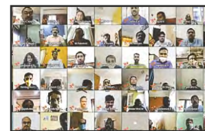
Some of the 2021 participants (Virtual event)

900+ Persons from 20 Countries had Participated in 2021. Some of the Speakers were: