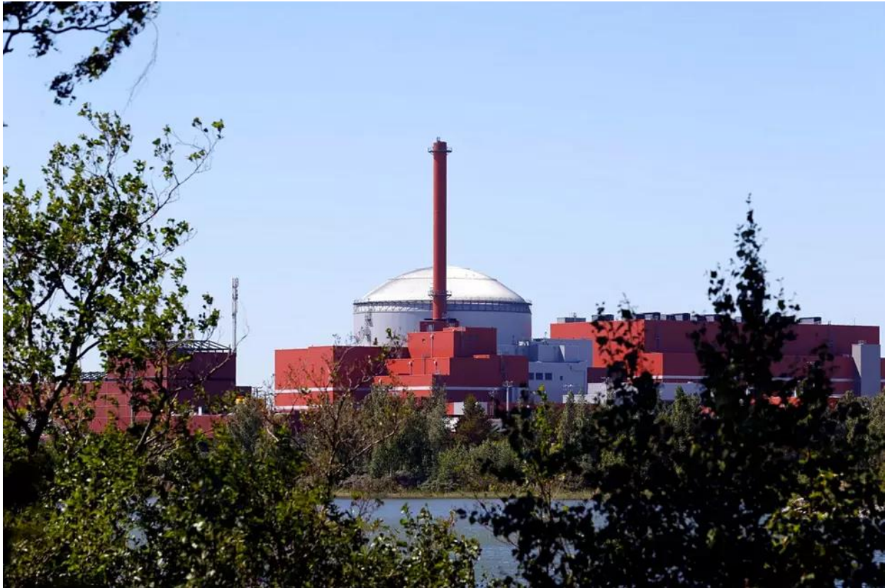
Olkiluoto 3 power station is now completed