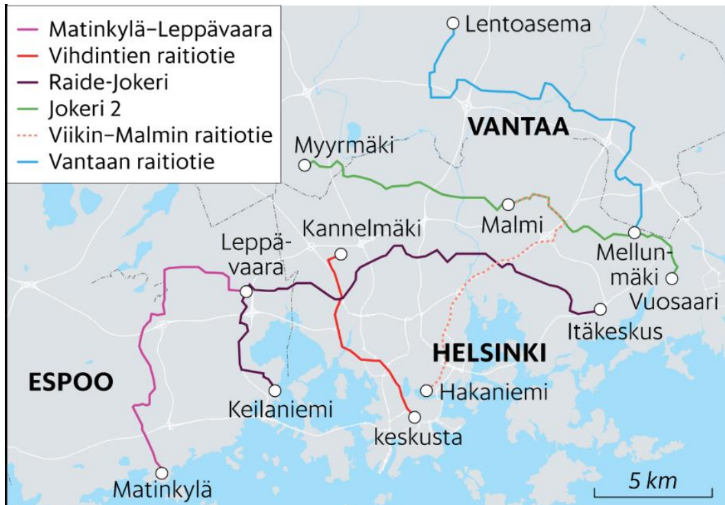
New rail lines considered for the Helsinki metropolitan area (graphics courtesy Sonia Zaki)

The consortium comprising YIT and VR Track is finalizing the construction of the Raide-Jokeri light rail line. The project is well ahead of the original time schedule, and construction works are almost completed. The new tracks are currently being tested with an all-terrain vehicle modified for running on tracks. Due to the smooth construction phase, it may be possible to start commercial operations in early 2024. Further to this, several rail lines are being considered for the Helsinki metropolitan area.