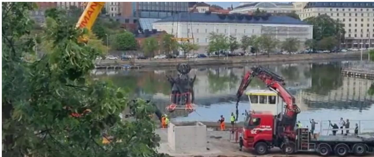
The World peace -statue being removed at Hakaniemi

As a part of the infrastructure works in Hakaniemi, the World peace [Мир во всем мире] statue by Oleg Kirjuhin, which was a gift from the City of Moscow to the City of Helsinki in the last days of Soviet Union, was removed from its current location.