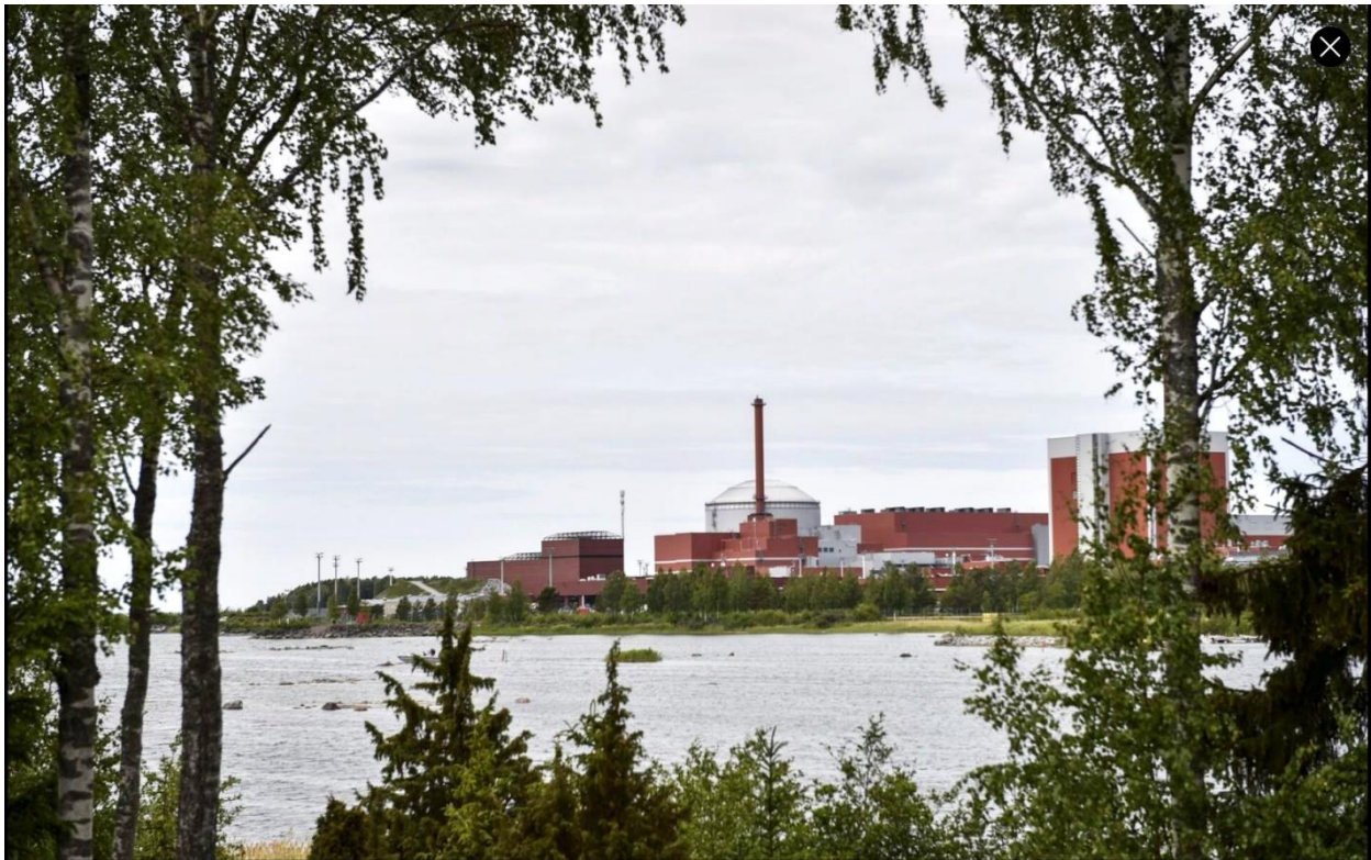
Olkiluoto 3 power station is now completed