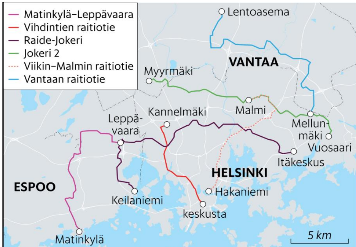
New rail lines considered for the Helsinki metropolitan area (graphics courtesy Sonia Zaki)

The consortium comprising YIT and VR Track is finalizing the construction of the Raide-Jokeri light rail line. The project is well ahead of the original time schedule, and construction works are almost completed. The new tracks are currently being tested with an all-terrain vehicle modified for running on tracks. Due to the smooth construction phase, it may be possible to start commercial operations before 2024. Further to this, several rail lines are being considered for the Helsinki metropolitan area.