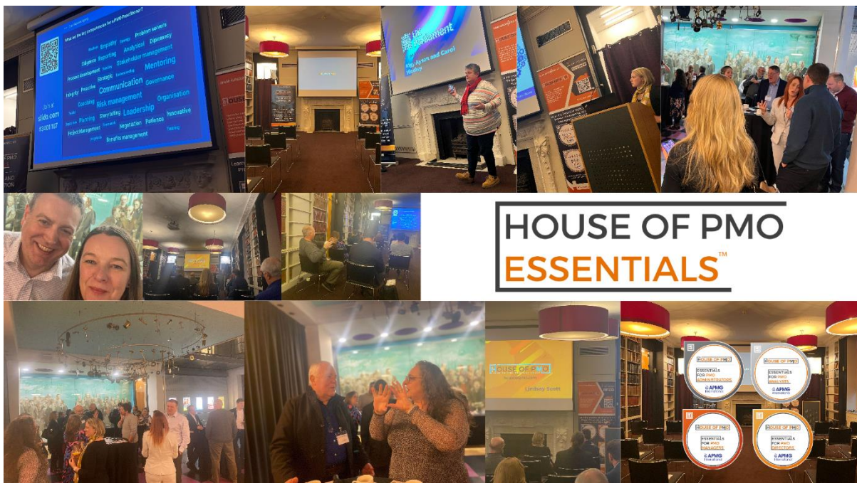
The House of PMO and APMG International Launch Event – Royal Institution of Great Britain, London , UK

**** https://houseofpmo.com/blog/2023/01/27/the-house-of-pmo-launches-the-essentials-certifications-for-pmo-professionals-mayfair-london-25th-january-2023/