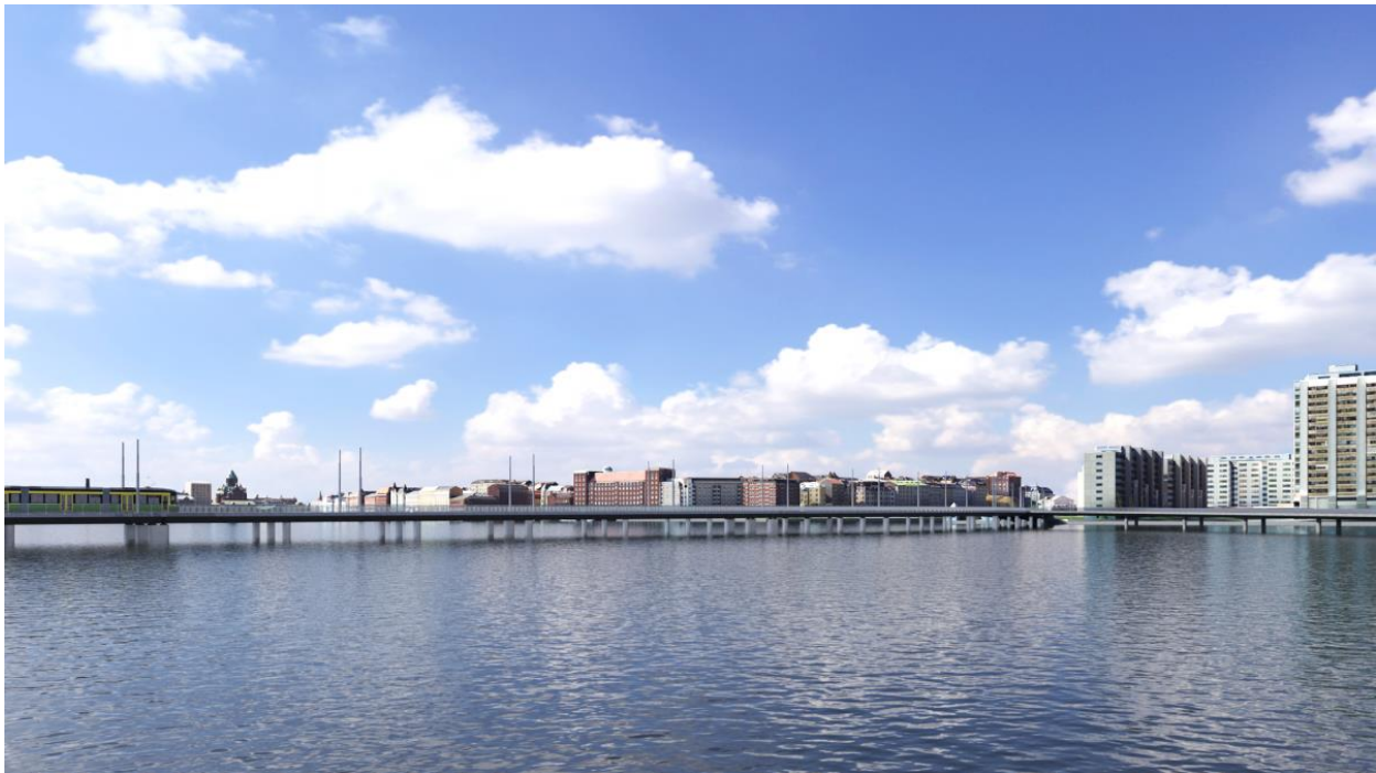
An artist's view of a tram crossing the Merihaansilta

Construction works are now proceeding in Kalasadama , as well as Verkkosaari . In addition to the bridges, more apartment buildings are being constructed along the future tram line. The tram line from Kalasadama to Pasila will start operations in 2024, and all the Kruunusillat bridges will be completed in 2027.