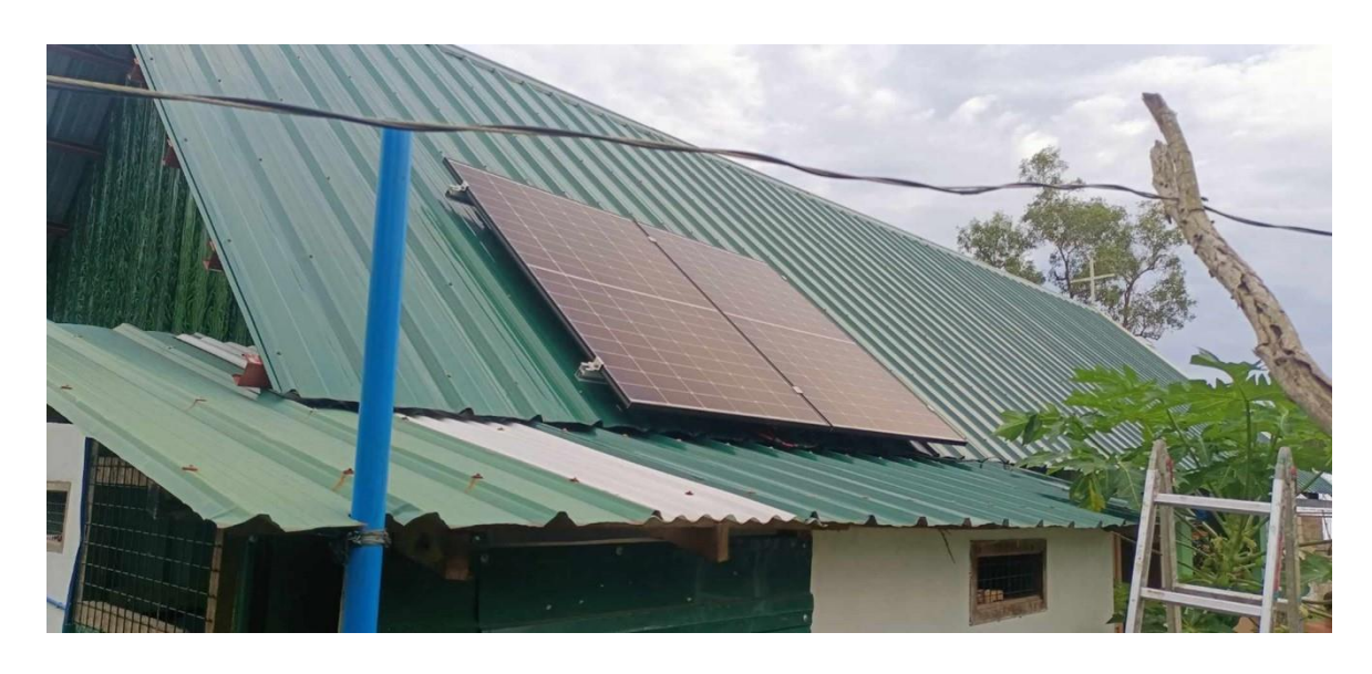
A Thanksgiving service will be held this weekend; then it will be my responsibility to continue fund raising for the other project components. [ NOTE: The 'Project' is comprised of several disparate, stand-alone components so some institutions would call it a Program , with separate Projects .]