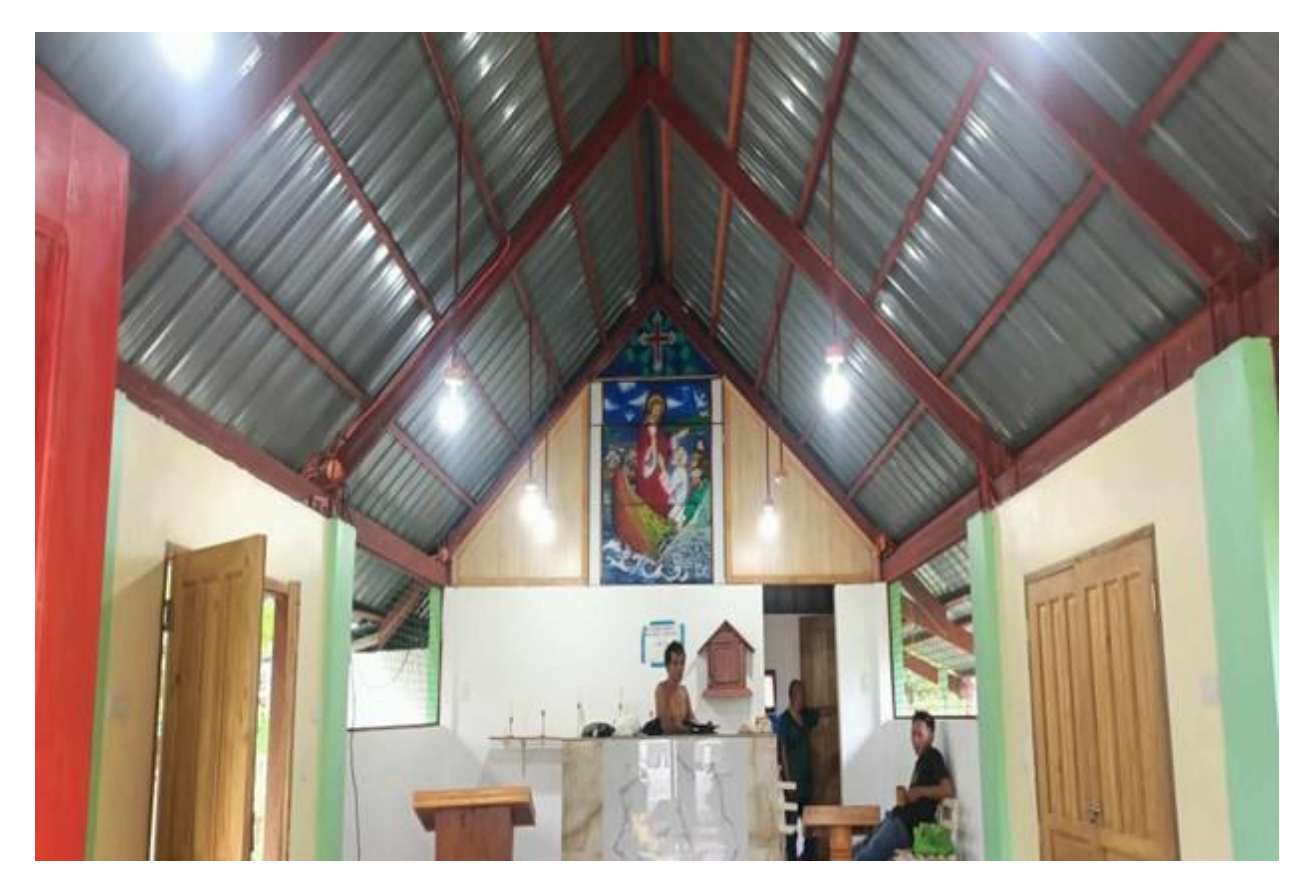
Since this is an <u>on-going</u> Church-initiated project -- rather than government funding -- subsequent steps to implement the full scope for this impoverished community <u>dependentirely upon voluntary donations</u>.