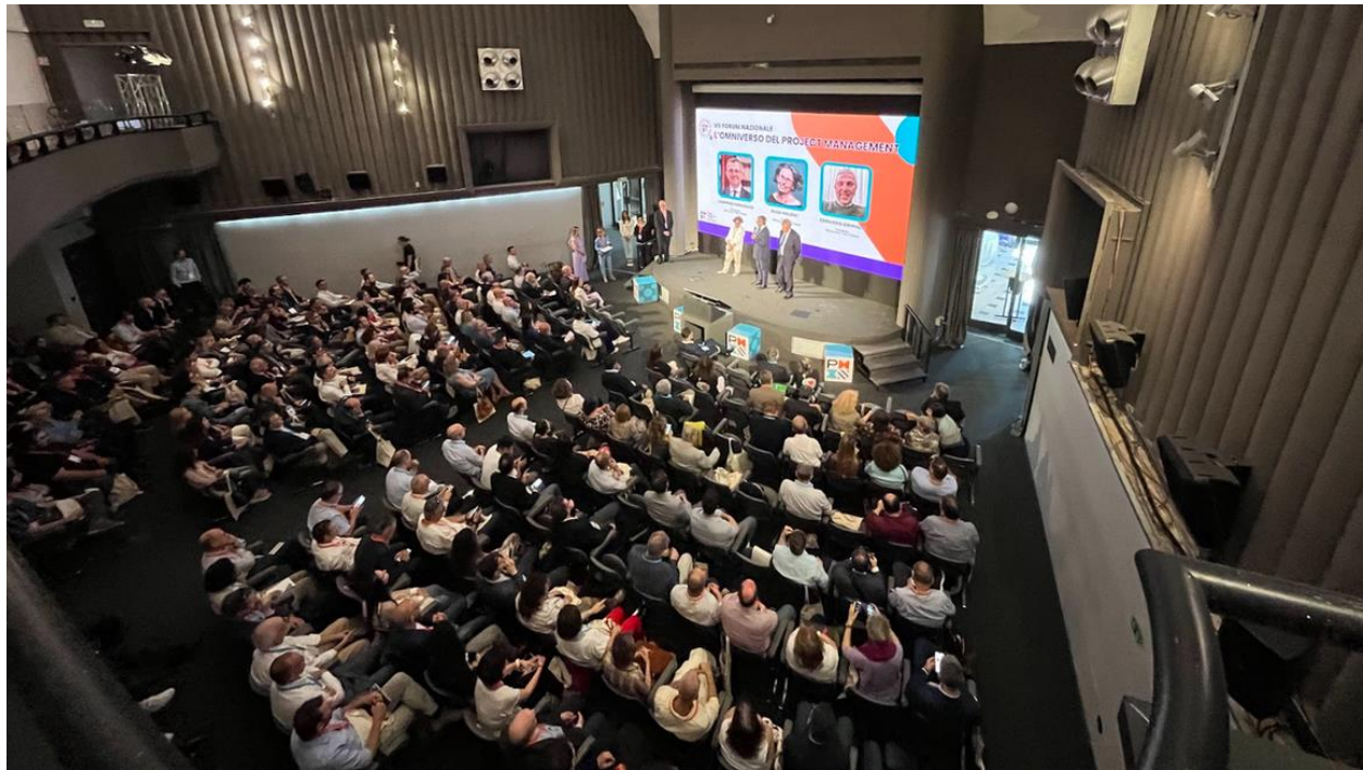
Auditorium of Carpegna Palace Domus Mariae Hotel - Rome